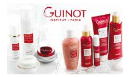
75 min 2,800++

In 75 minutes, use the best anti- ageing serum and soft mask to visibly rejuvenate your face. This facial redensifies the skin, revitalizes and smoothes wrinkles, with visible results. More than just a rejuvenating effect, the treatment combats the signs of ageing.